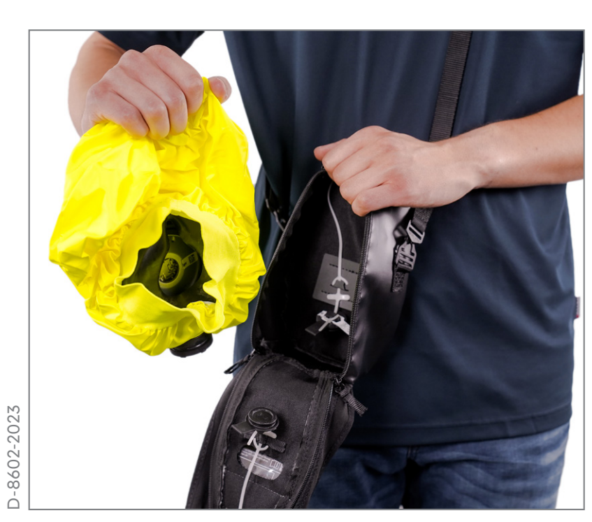
The second filter sealing plug is detached from the hood.