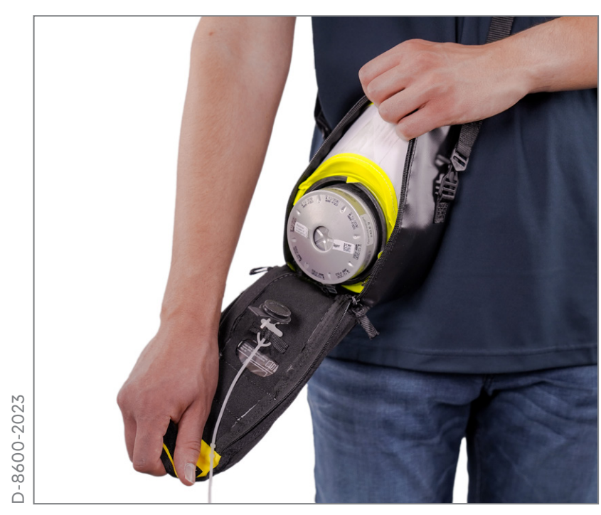
Open the Soft Pack completely so that the front filter sealing plug is removed.