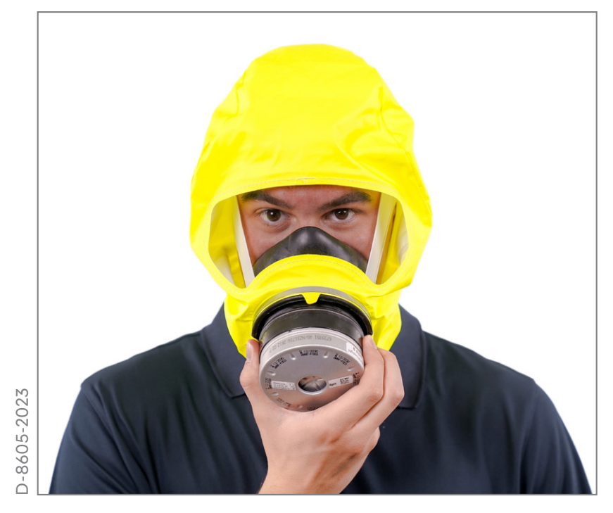
If negative pressure is not generated readjust the half mask to ensure a close fit over nose and mouth.