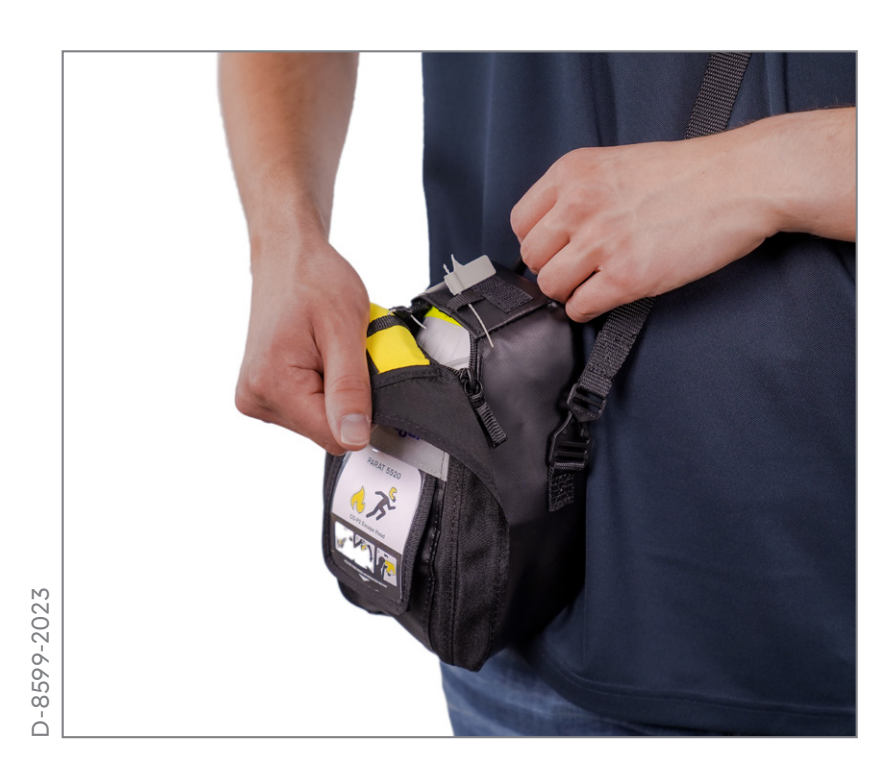
Pull the yellow flap downwards. The security seal breaks automatically.