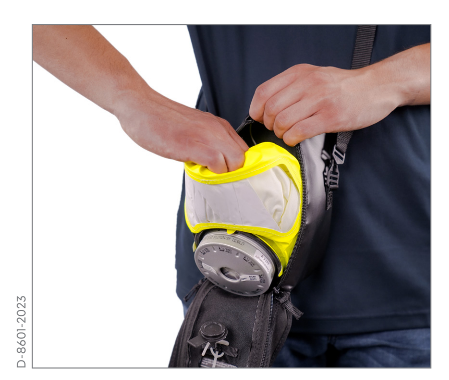
Remove the hood from the Soft Pack.