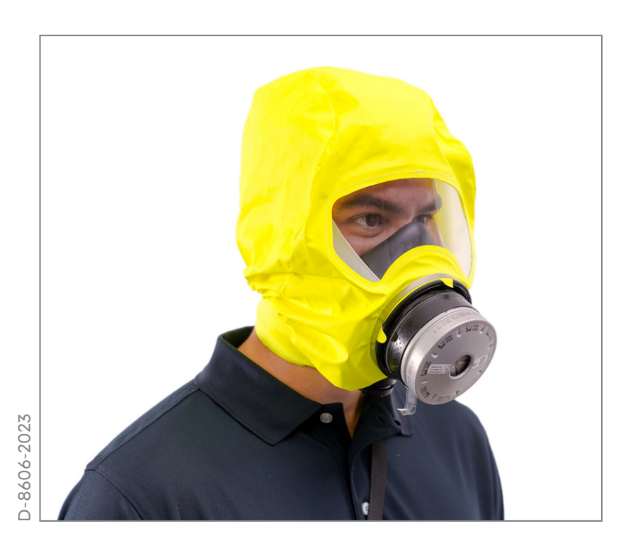
Ready for escape.

Always read and understand the instructions for use of the Dräger PARAT® escape device prior to use!