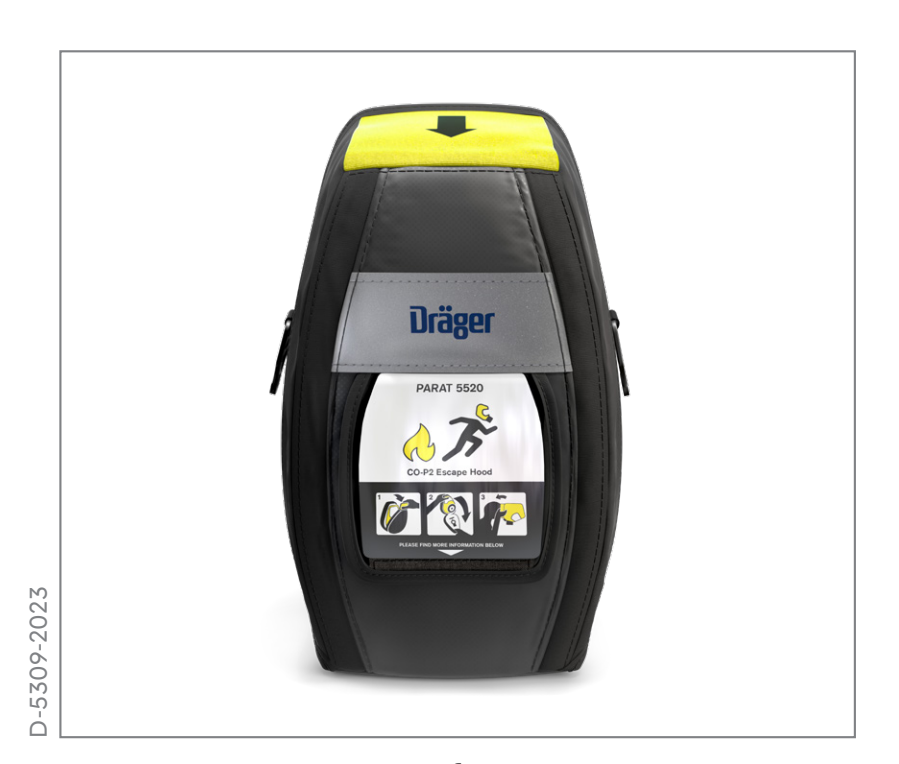
Dräger PARAT® Soft Pack