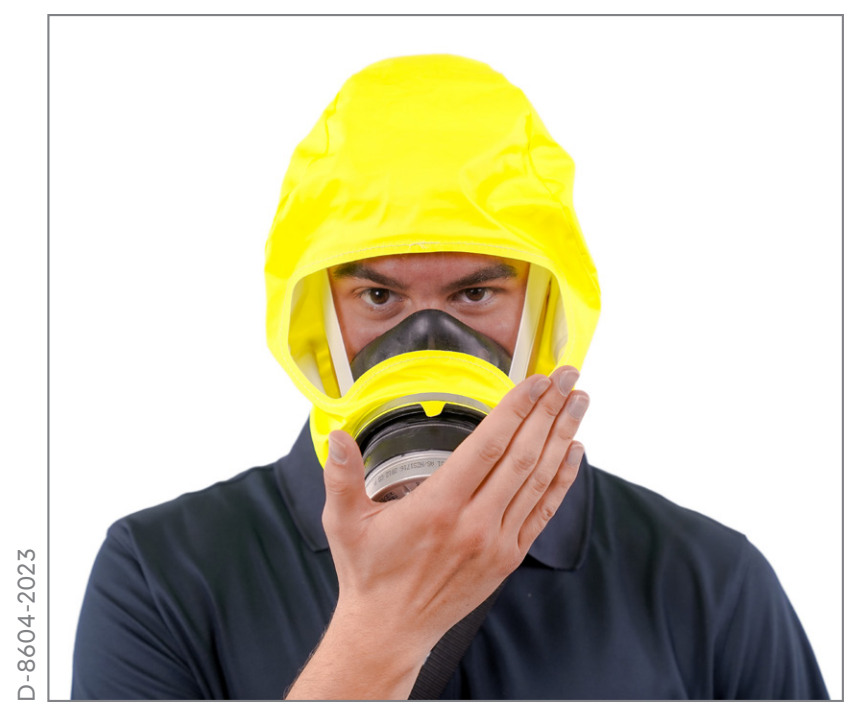
Check the fit of the half mask by closing the front filter opening with the palm of your hand. Breathe in.