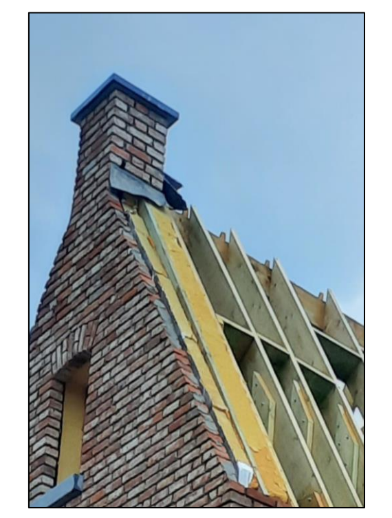
MAXTWO is used to create an airtight seal of closed cell foam between wall and roof connection.