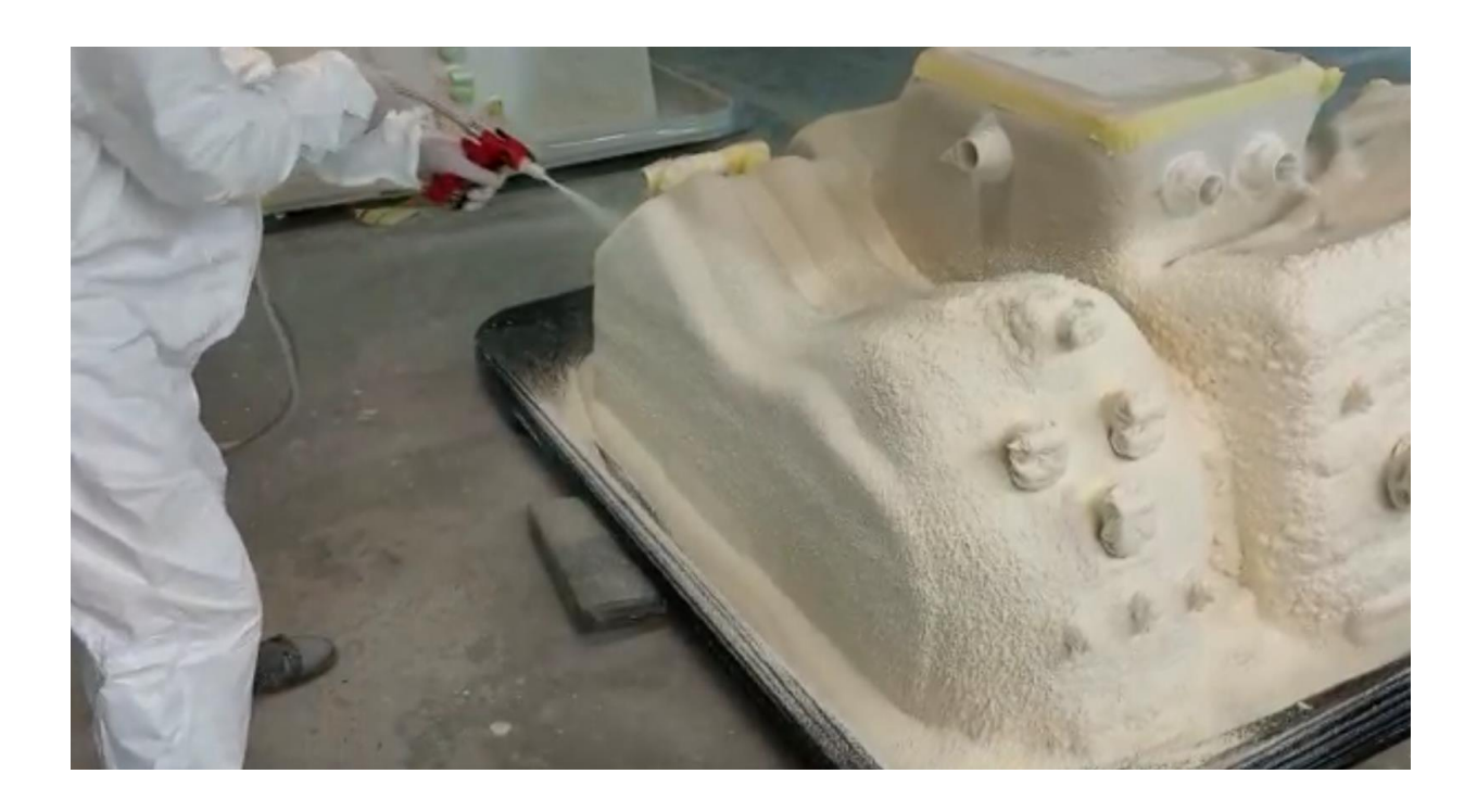
MAXTWO closed cell foam is used as insulation material for hot tubs.