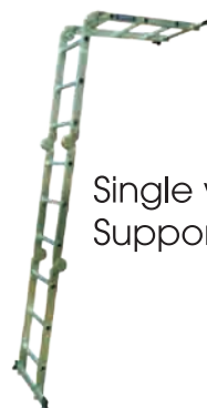
Single with Support